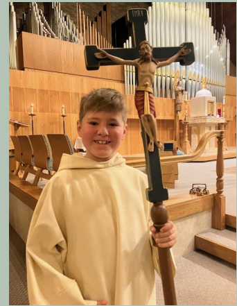
... and always with a smile!