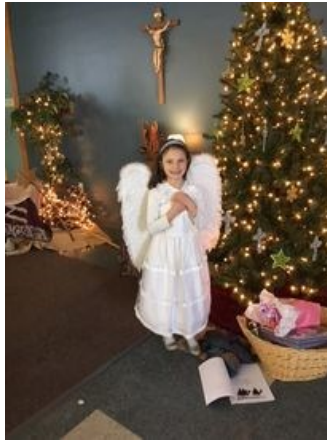
From our files... one of our littlest angels in 2018.